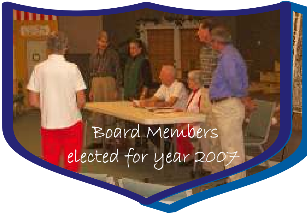
Board Members elected for year 2007