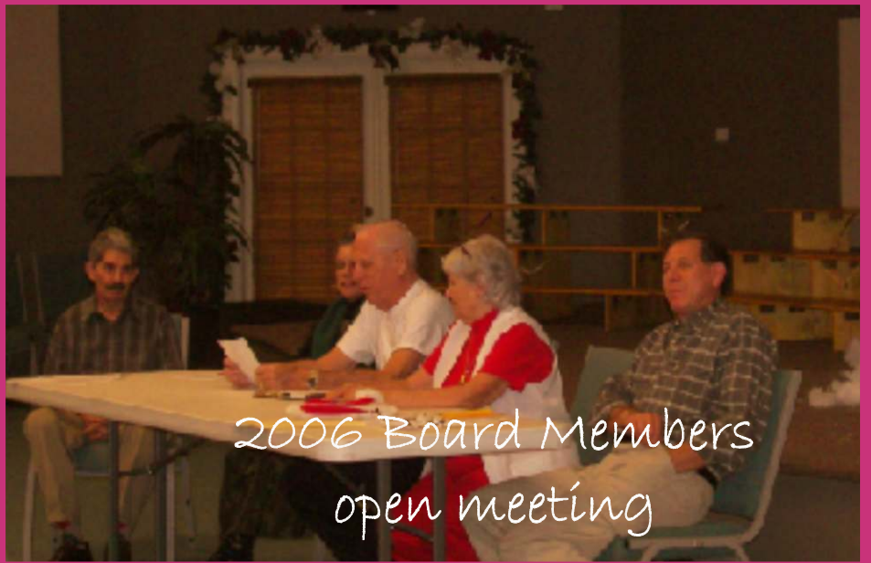
2006 Board Members open meeting